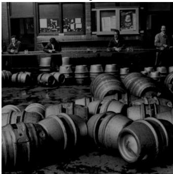
Guinness Brewery, Saint James Gate, Dublin, 1964 by Erich Hartmann | Silver gelatin print | © Erich Hartmann Estate / MagnumPhotos, Courtesy of CLAIRbyKAHN