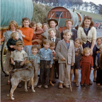
IRELAND. Killorglin, County Kerry, 1954 | Gypsy family by Inge Morath | Inge Morath Estate / Magnum Photos, Courtesy of CLAIRbyKAHN