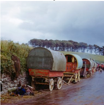
IRELAND. Killorglin County Kerry, 1945 | Gypsy Wagons by Inge Morath | Inge Morath Estate / Magnum Photos, Courtesy of CLAIRbyKAHN