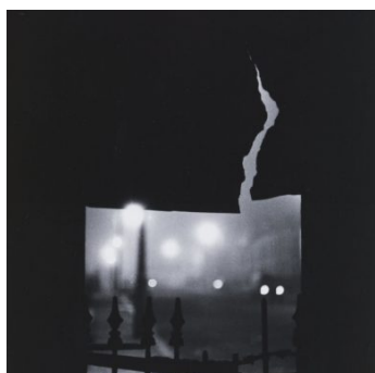
Dublin Street at Night, 1964 by Erich Hartmann | Silver gelatin print | © Erich Hartmann Estate / MagnumPhotos, Courtesy of CLAIRbyKAHN