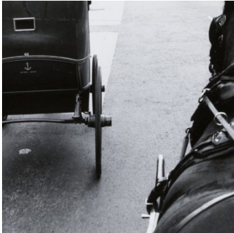
Dublin, 1964 (Horse and Carriage) by Erich Hartmann | Silver gelatin print | © Erich Hartmann Estate / MagnumPhotos, Courtesy of CLAIRbyKAHN